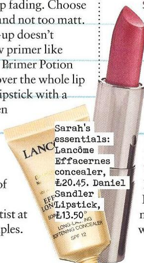
Sarah's essentials: Lancôme Effacernes concealer, £20.45. Daniel Sandler Lipstick, £13.50

Readers' most common question is what eye-shadow colours to choose. Any advice? Do you want a natural or dramatic look? For a natural style, choose a soft taupe eye shadow with a chocolate eyeliner, or a soft pink eye shadow with a grey liner. For a dramatic look, avoid black as it can look harsh in photos. Opt for light grey eye shadow with a dark grey eyeliner instead. Use black mascara to intensify the eyes; brown just isn't strong enough. How can a bride ensure her make-up lasts all day without it looking plastered on? Start with a clear primer to prevent your complexion make-up fading. Choose a foundation that's light and not too matt. To ensure your eye make-up doesn't crease, use an eye-shadow primer like Urban Decay Eyeshadow Primer Potion (£14.50). Apply lip liner over the whole lip area, then three coats of lipstick with a brush, blotting in-between with a tissue, with a dot of gloss over the top. What's the biggest mistake brides make? Wearing the wrong type of foundation. Get colour-matched by a make-up artist at a counter and ask for samples.